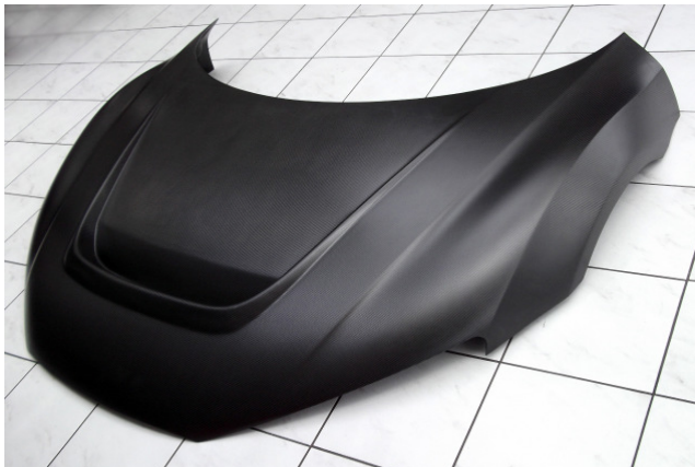
SD part number: 0R8.100.200.300PC